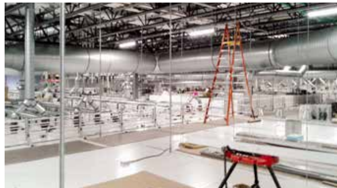
Hot and chilled water piping and ductwork serving the hatches