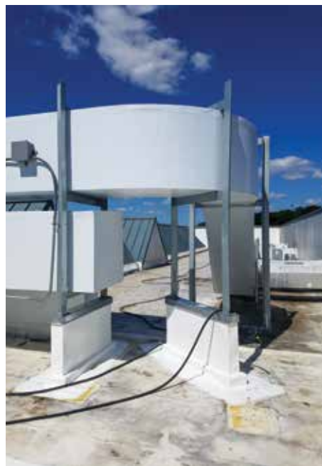
Rooftop ductwork supports

Because the building was occupied, we had from Friday night after surgeries were completed until Sunday afternoon to complete this work. Significant coordination was needed between us, our subcontractors, and the Apple Hill Medical Center staff to ensure a smooth project. Everything ended well due to great teamwork!