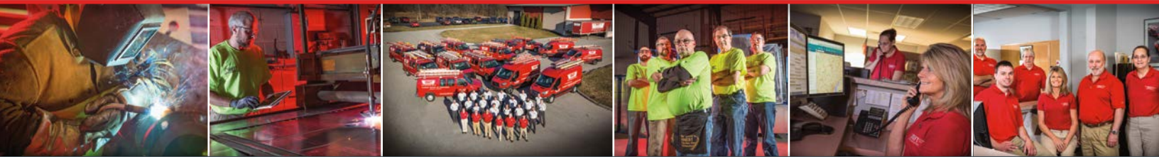
Useful tips, news and information from James CRAFT & Son, Inc.