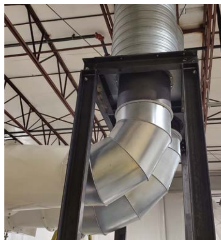
Scrap system exhaust duct