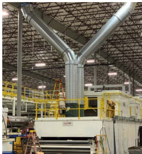
Intake and exhaust duct