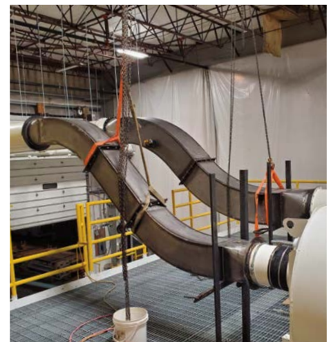
Scrap system intake duct