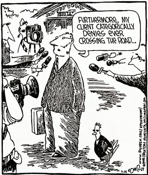
SPEED BUMP Dave Coverly