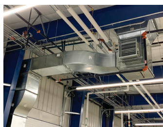
Stainless ductwork and vents.