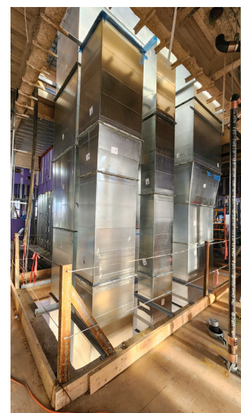
Shaft ducts installed.