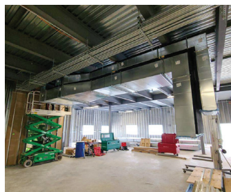
Truck duct and drops installed.