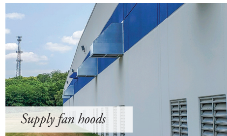
Supply fan hoods