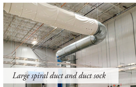
Large spiral duct and duct sock