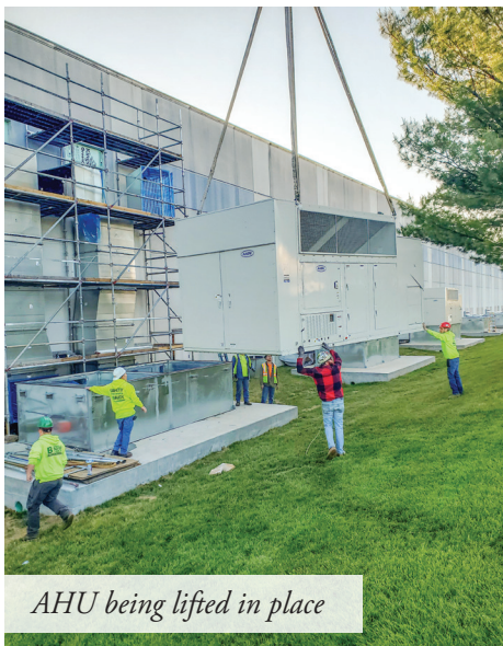
AHU being lifted in place

Useful tips, news and information from James CRAFT & Son, Inc.