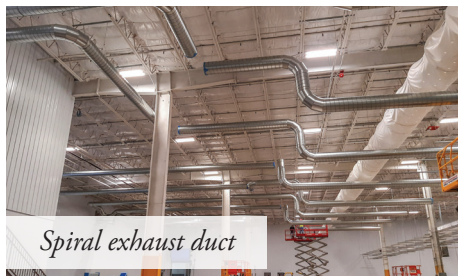
Spiral exhaust duct