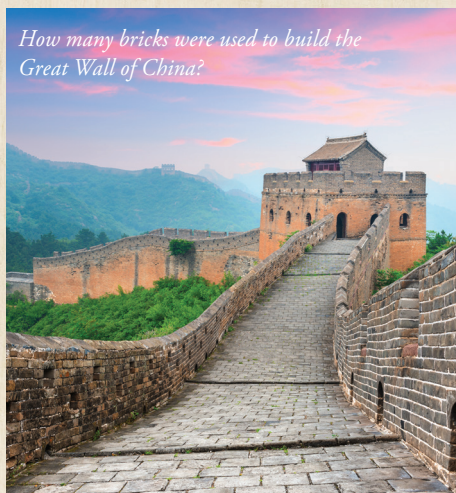
How many bricks were used to build the Great Wall of China?